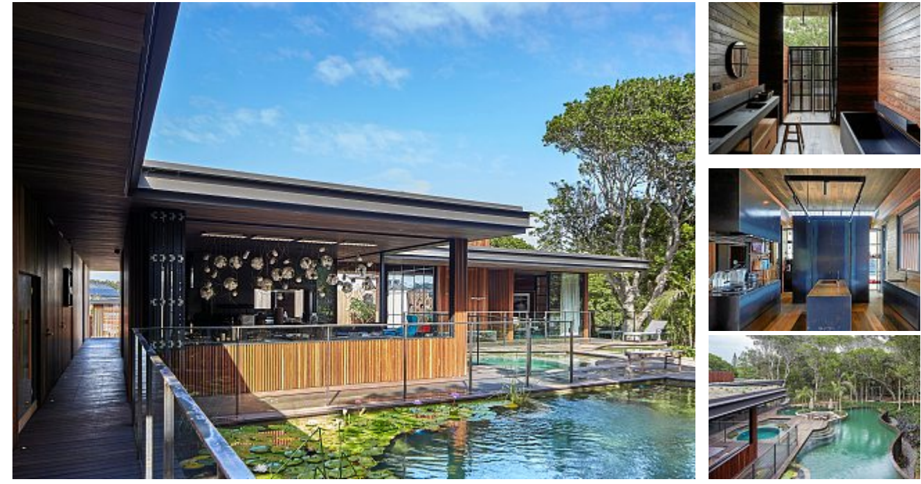
GRAND SCALE: The project includes six bedrooms, six bathrooms, 12 showers, wine cellar, guest quarters, beach front bar, rooftop garden, copper cladded double garage, and a free-form infinity edge pool with island deck and firepit.

In terms of energy efficiency, the home is second to none. The project